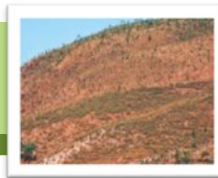
Forest Cover change before the Community forest and after the community forest Photo taken from same latitude and altitude from Nepal Swiss Community Forestry Program.

mobilizing locally available and communally owned natural capital forests both direct through the promotion of wild edibles and indirectly by providing financial and social safety nets to the poor. Forest-based income accounts for a substantial portion of overall household income. Products extracted and total value often varies by household income in many rural areas, while in others community forestry is becoming a tool to strengthen communities. In the current phase Community Forestry is