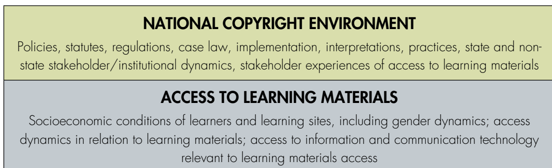
Figure 1: Constituent parts of the Copyright Environment & Access to Learning Materials