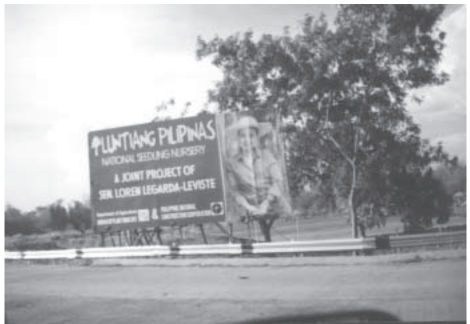
The project phenomena - very public forest project signs pepper the rural roadsides in some areas.

Typical ‘success’ stories are often molded to fit the requirements of the development project industry. They exist in false economies (subsidized by outside funding), and often donors or individuals have created institutional linkages that are not the norm. These do not provide sufficient evidence to have more of the same. Only taking into consideration the mathematics, in terms of costs, scaling up is out of the question. In fact the lessons from embracing the many more failed and forgotten forestry projects, and the experiences community members have had with them could yield