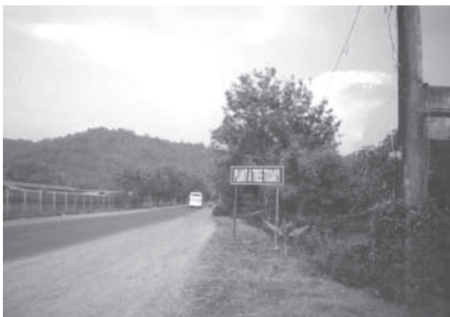
A government sign encourages people to plant trees.

Some win from a restrictive forest policy. Trying to get any product that will thus be labelled as 'illegal' to the market will help those individual regulators who decide to benefit from 'under the table' salary supplements and allow the product to pass. Forest guards may actually become road